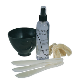
Philips Speed Spray