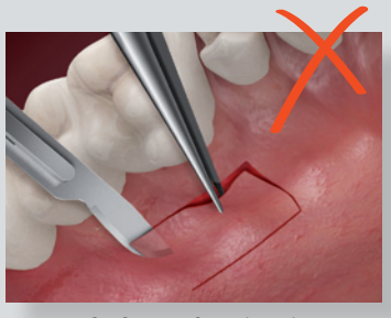
Harvest of soft tissue from the palate is avoided with Geistlich Mucograft®.