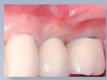
Outcome of restored keratinised tissue with Geistlich Mucograft® after 6 months (Dr. A. Charles).