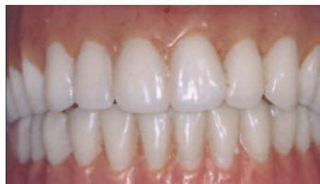
3. The overdenture securely in place.