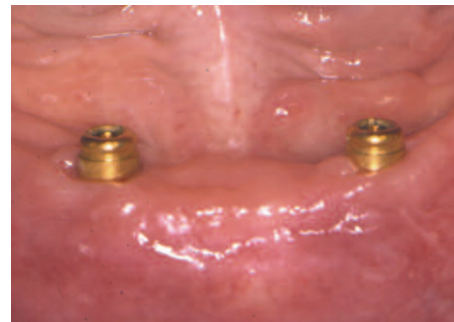
2. LOCATOR Abutments in place.